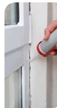
Limited Pest Proofing (Select plans)