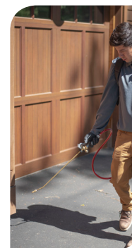
Exterior Inspection & Treatment