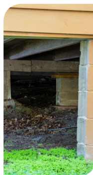
Crawl Space Inspection

Each service starts with an initial setup and full site assessment.